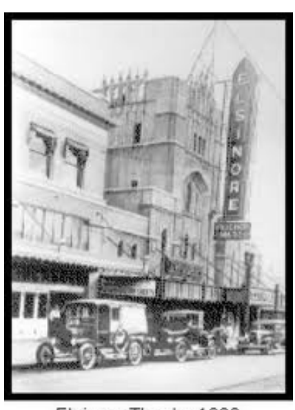
Elsinore Theatre 1926